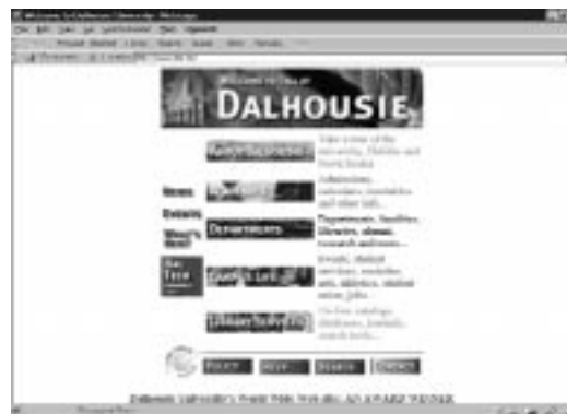
Figure 1: Dalhousie University Web Site as it appeared during the study

The top two menu levels (homepage and second-level) are consistent in style and presentation. The four buttons on the bottom in Figure 1 appear on all pages with the exception of Policy which is dropped at the second and third levels in favour of a Dal Home button. Although not evident in Figure 1, the buttons and annotated text to the right of each button are multi-coloured, giving a pleasing visual appearance. This design is applied consistently in