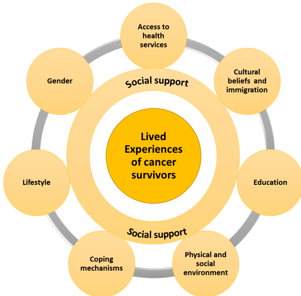
Figure 2: A framework represents how social determinants of health were shaping the lived experiences of Middle Eastern immigrant women during their cancer survivorship journey.